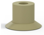
Variant reference: 70S 15CN A