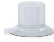
Variant reference: 70S 15SLT A