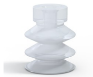
Variant reference: 21 18SLT A