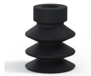
Variant reference: 21 18NI A