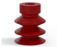
Variant reference: 21 18SL A