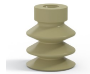
Variant reference: 21 18CN A