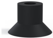
Variant reference: 7 30NI A