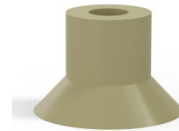
Variant reference: 7 30CN A