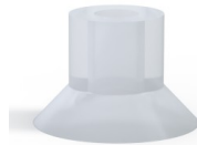
Variant reference: 7 30SLT A