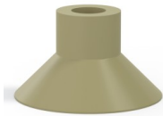
Variant reference: 71 34CN A