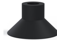
Variant reference: 71 34NI A