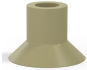
Variant reference: 72 40CN A