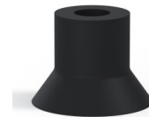
Variant reference: 73 40NI A