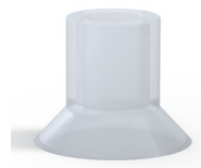
Variant reference: 75 20SLT A