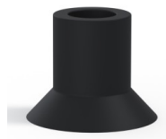
Variant reference: 75 20NI A