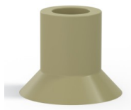
Variant reference: 75 20CN A