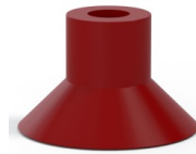
Variant reference: 78 30SL/RV A