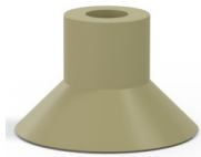
Variant reference: 78 30CN A