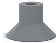
Variant reference: 78 30NR A