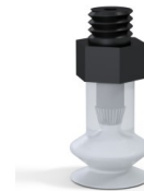
Variant reference: 91 08SLT M5M