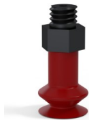
Variant reference: 91 08SL M5M