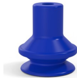
Variant reference: 91 16PU A