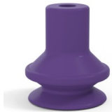
Variant reference: 91 16MNT A