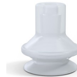
Variant reference: 91 16SLT A