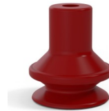
Variant reference: 91 16SL A