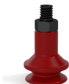
Variant reference: 91 16SL M5M