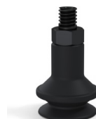
Variant reference: 91 16NI M5M