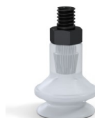
Variant reference: 91 16SLT M5M