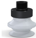
Variant reference: 91 20SLT M18