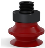
Variant reference: 91 20SL M18