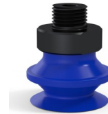
Variant reference: 91 20PU M18