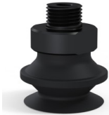
Variant reference: 91 20NI M18