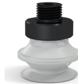
Variant reference: 91 20TPU M18