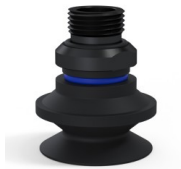
Variant reference: 91 31NI 38D-2 • Color: Black • Matter: Nitrile