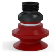
Variant reference: 91 31SL 38D-2 • Color: Red food-grade CE certification • Matter: Silicone • Shore Hardness: SH60