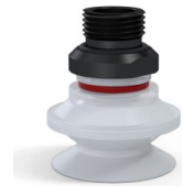
Variant reference: 91 31SLT 38D-2 • Color: Translucent • CE food certified • Matter: Silicone • Shore Hardness: SH60