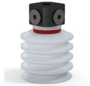
Variant reference: 92 50SLT 18D-3-BD