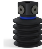
Variant reference: 92 50NI 18D-3-BD