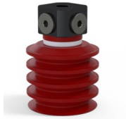
Variant reference: 92 50SL 18D-3-BD