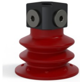
Variant reference: 96 52SL 18D-3-BD