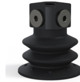
Variant reference: 96 52NI 18D-3-BD