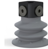
Variant reference: 96 52NR 18D-3-BD