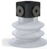
Variant reference: 96 52SLT 18D-3-BD