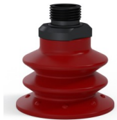
Variant reference: 96 52SL 38D-2