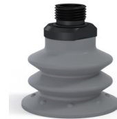
Variant reference: 96 52NR 38D-2