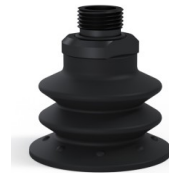
Variant reference: 96 52NI 38D-2