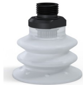
Variant reference: 96 52SLT 38D-2