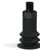
Variant reference: 96 15NI M5